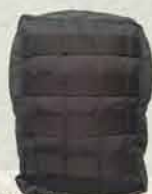
TAS BLACK 1307 POUCH FRONT and BACK VIEWS