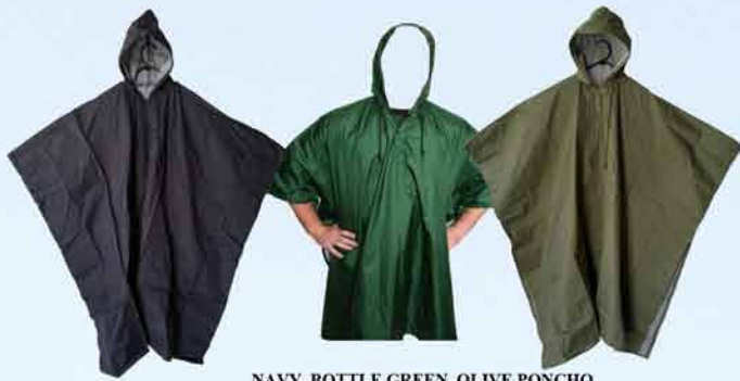
NAVY, BOTTLE GREEN, OLIVE PONCHO

Made of PU coated Micro-Ripstop polyester