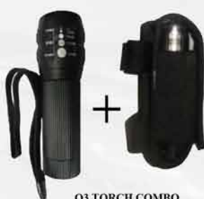
Q3 TORCH COMBO