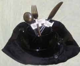
PVC MESS KIT