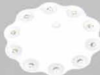
LED S0009 LIGHT