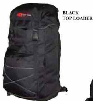
BLACK TOP LOADER