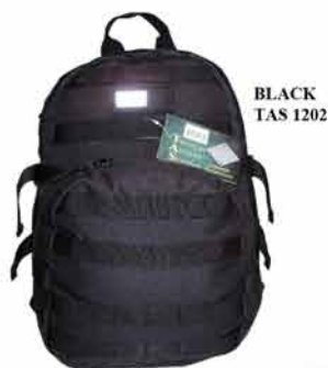
BLACK TAS 1202