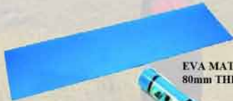
EVA MAT 80mm THICKNESS