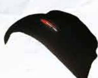
WOOL ACRYLIC BEANIE