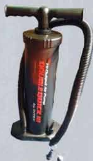
DOUBLE ACTION HAND PUMP