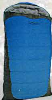
SOUTH POLE XL HOODED