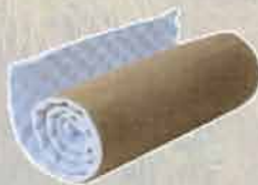
EVA WAVE MAT 140mm THICKNESS