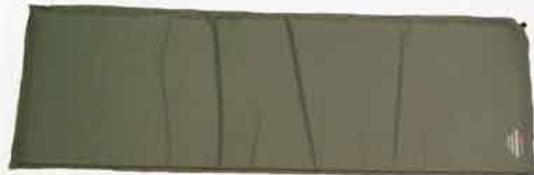
CAMP MAT LONG SELF INFLATING MAT

Above top: Underside of mat in the Standard series featuring the non-slip boomerang design Above: Top side of mat in Standard series ** ALL MATS COME PACKED IN A 150 Denier OXFORD CARRY BAG with a REPAIR KIT **