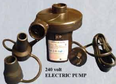
240 volt ELECTRIC PUMP