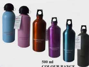
500 ml COLOUR RANGE