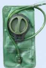
TAS TPU HYDRO BLADDER 1.5 - 2L