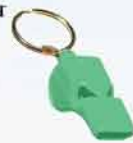
TAS SAFETY WHISTLE