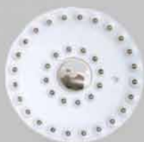
LED 36 LIGHT