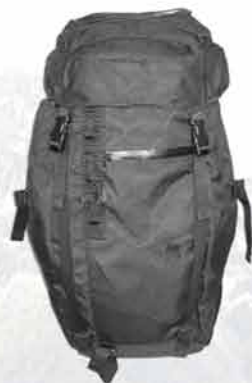
BLACK TAS GUIDE 45