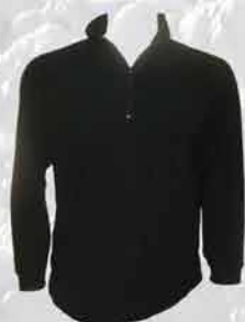
THERMAX LONG SLEEVE