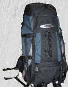
EXPLORER 1 RUCKSACK