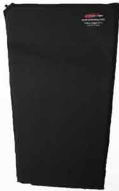
STANDARD SERIES SELF INFLATING MAT