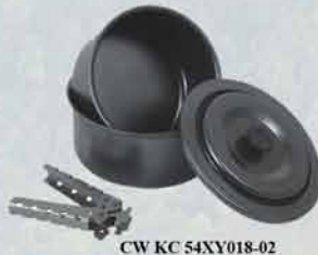
CW KC 54XY018-02