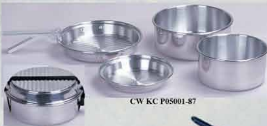
CW KC P05001-87