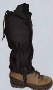
BLACK 3/4 GAITER