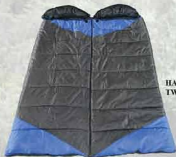
HAPPY CAMPER TWIN PACK