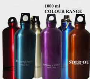
1000 ml COLOUR RANGE