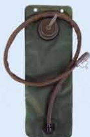
HYDRO BLADDER GREEN