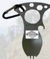
EAT IT TOOL