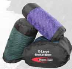
MICRO FIBRE TOWELS- PACKAGING