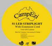
51 LED STRIP LIGHT EXTENSION CORD