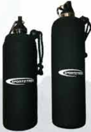
NEOPRENE DRINK BOTTLE COVERS