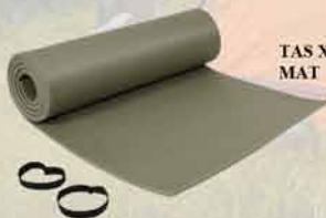
TAS XPE MAT