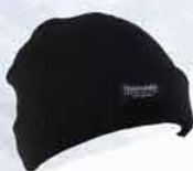
WOOL THINSULATE BEANIE