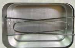
TAS DIXIE MESS KIT