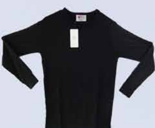
WOOL LONG SLEEVE