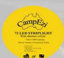
72 LED STRIP LIGHT with DIMMER SWITCH