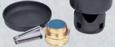
CW KC 54XY017-01