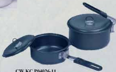
CW KC P04026-11