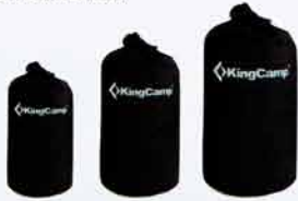
KING CAMP OXFORD TPU DRY BAGS