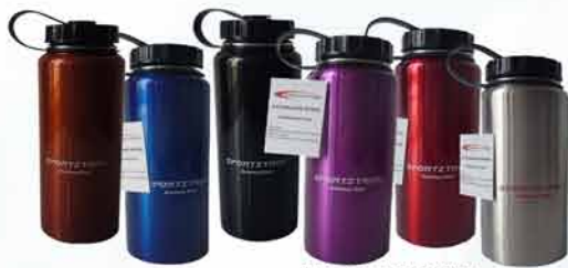
1000ml WIDE MOUTH DRINK BOTTLES