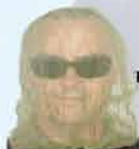
TAS MOZZIE HEADNET