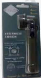
GREEN ANGLE HEAD TORCH