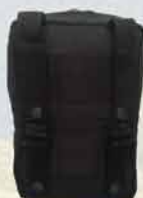
TAS BLACK 1307 POUCH FRONT and BACK VIEWS