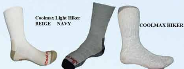
Coolmax Light Hiker BEIGE NAVY