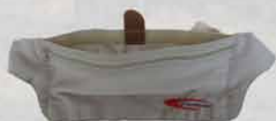
MONEY BELT- DELUXE