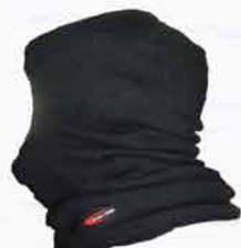
ACRYLIC FLEECE BALACLAVA