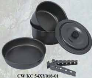
CW KC 54XY018-01