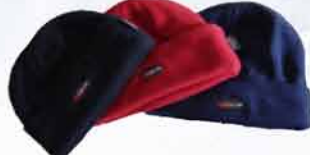
FLEECE BEANIE DG250