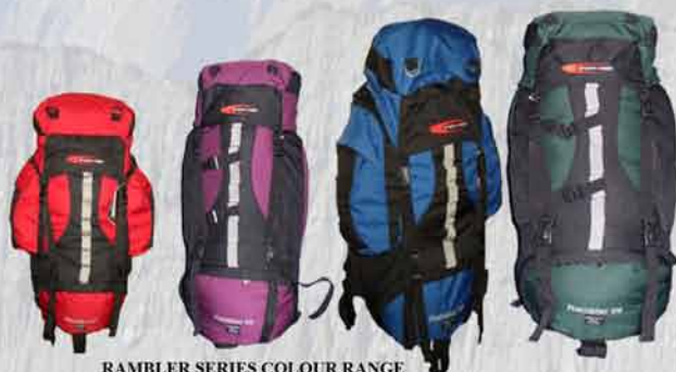
RAMBLER SERIES COLOUR RANGE