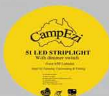
51 LED STRIP LIGHT with DIMMER SWITCH