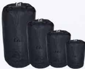
TAS DRY BAGS