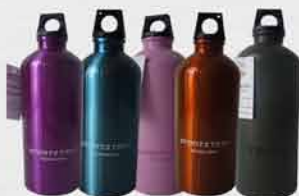
750 ml COLOUR RANGE