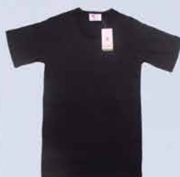
WOOL SHORT SLEEVE