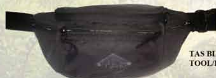
TAS BLACK TOOL/BUMBAG