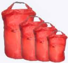
SPORTZTREK DRY BAGS