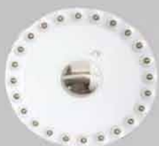
LED 24 LIGHT