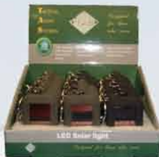
TAS KEYRING LED