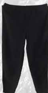
THERMAX LONG JOHNS