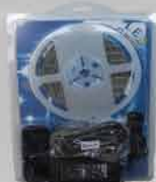
5 METRE STRIP LIGHT