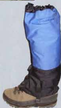
WSS-G1 COBAL.T GAITER