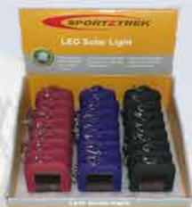
SPORTZTREK KEYRING LED