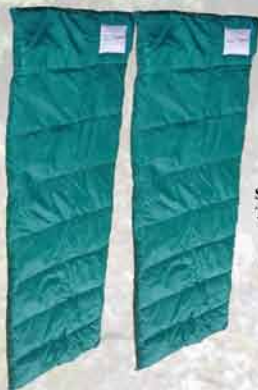
SUMMER CAMPER TWIN PACK