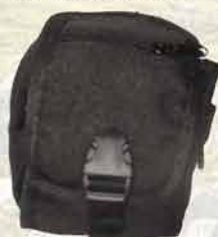
TAS BLACK 1204 POUCH