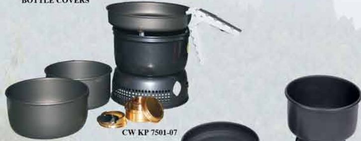
CW KP 7501-07