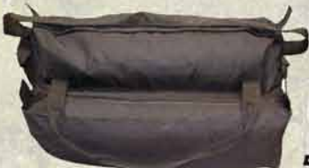
BLACK DIVE BAG