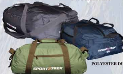
POLYESTER DUFFLE BAGS