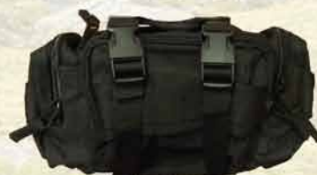
TAS BLACK 1204 POUCH