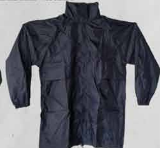
STOWAWAY RAIN JACKET