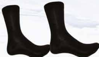
POLYPRO LINER SOCKS