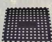
CAMP MAT SQUARE