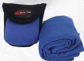
MICRO VELOUR TRAVEL TOWELS