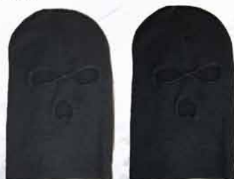
IRA BALACLAVA Acrylic