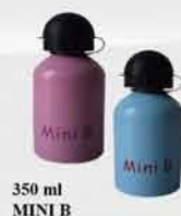
350 ml MINI B