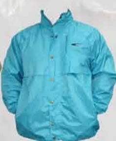
BREATHABLE RAIN JACKET