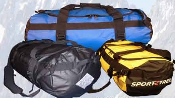
PVC DUFFLE BAGS