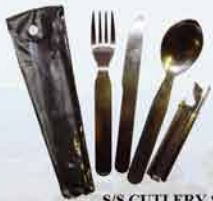
S/S CUTLERY SET