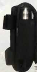
TAS BLACK 14 TORCH POUCH