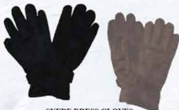
SUEDE DRESS GLOVES