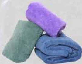
MICRO FIBRE TOWELS