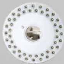
LED 48 LIGHT