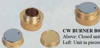
CW BURNER B001 Above: Closed unit Left: Unit in pieces